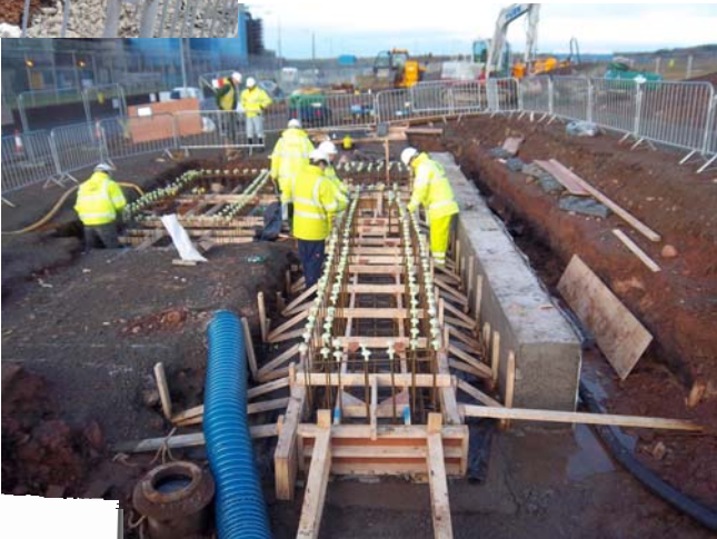
Installation of Electrical Overlay System