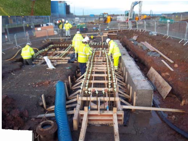
Installation of Electrical Overlay System